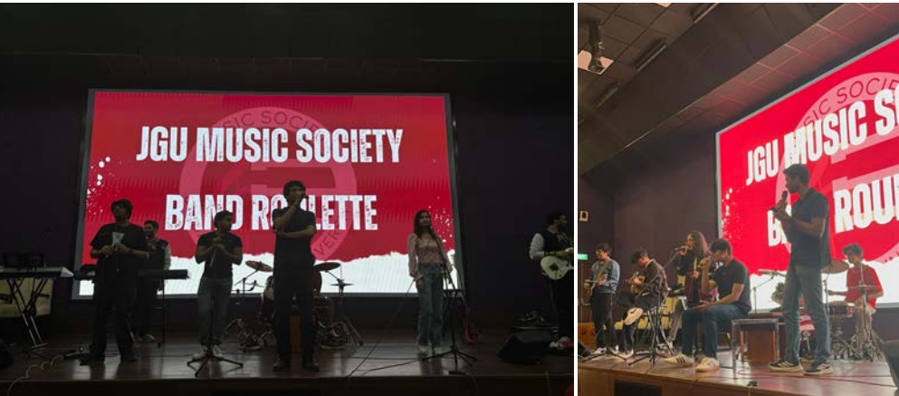
The JGU Music Society hosted the second edition of Band Roulette, following its successful debut last year, at the Performing Arts Academy (PAA). This event brought musicians and vocalists together in a unique, spontaneous collaboration, fostering creativity, camaraderie, and musical exploration. Participants signed up individually and were randomly assigned to bands through a chit-based selection system, giving them just a few days