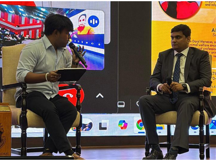
JGU AWS organises seminar on animal rights and protection The Animal Welfare Society , in collaboration with Dhyan Foundation and IPF, organized an insightful seminar on animal rights and protection laws. The discussion covered key topics such as the constitutional foundation of animal rights in India, legal provisions and judicial interpretations, challenges of awareness among younger generations, and strategies to bridge these gaps through empathy and legal mechanisms.