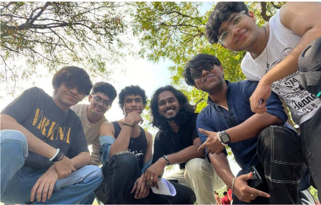
‘Angaare’, JGU Music Society’s Band, won third prize, and received a special mention for their original composition at BML Munjal University’s Inter-College Cultural Fest