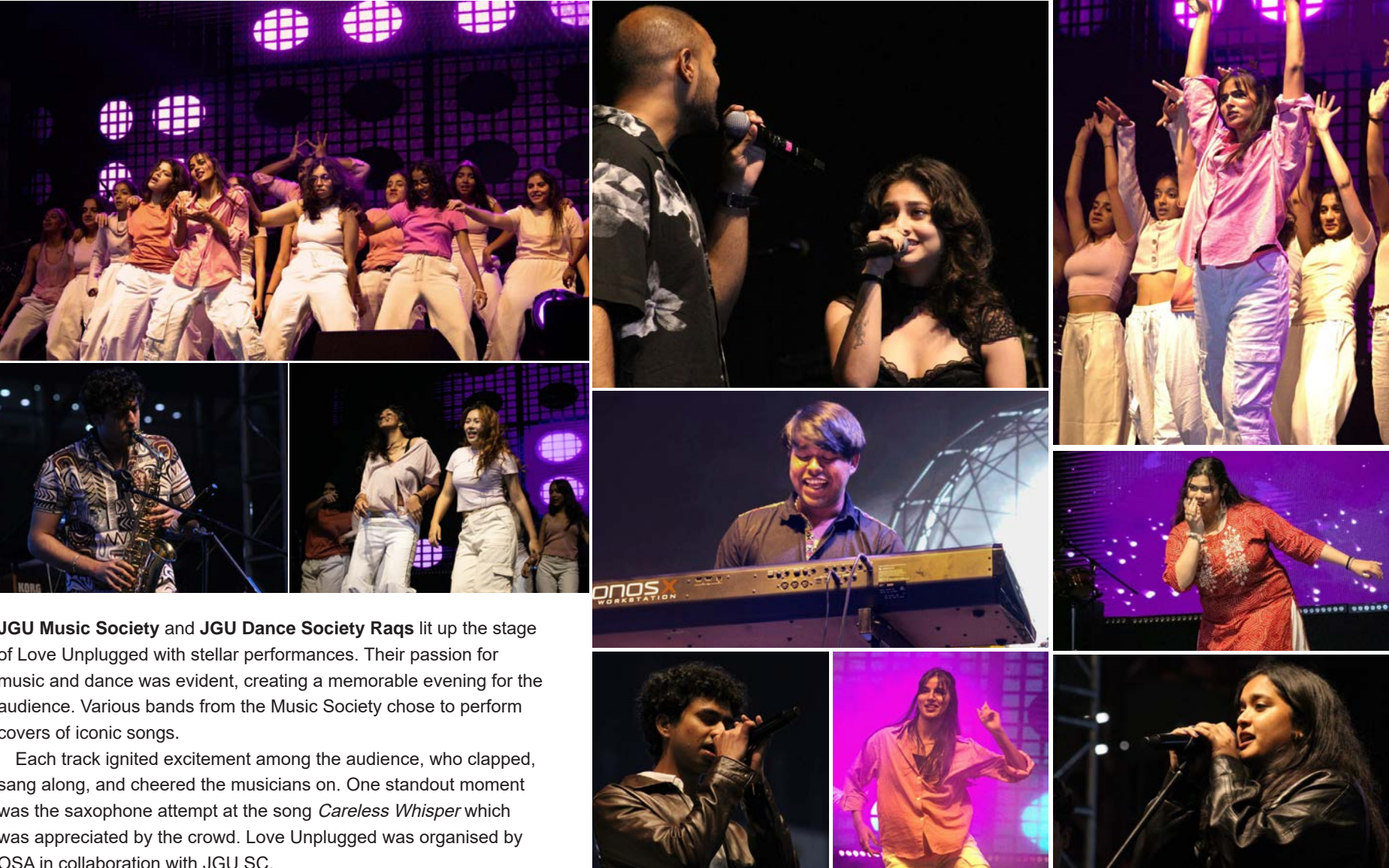
JGU Music Society and JGU Dance Society Raqs lit up the stage of Love Unplugged with stellar performances. Their passion for music and dance was evident, creating a memorable evening for the audience. Various bands from the Music Society chose to perform covers of iconic songs. Each track ignited excitement among the audience, who clapped, sang along, and cheered the musicians on. One standout moment was the saxophone attempt at the song Careless Whisper which was appreciated by the crowd. Love Unplugged was organised by OSA in collaboration with JGU SC.