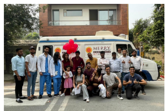
Members of the JGU Theatre Society with the crew of Mahima Production House, shooting an advertisement for 'Merry Health Ambulance Services'