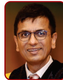
Hon'ble Dr. Justice D.Y. Chandrachud Judge Supreme Court of India

will deliver the Distinguished Public Lecture